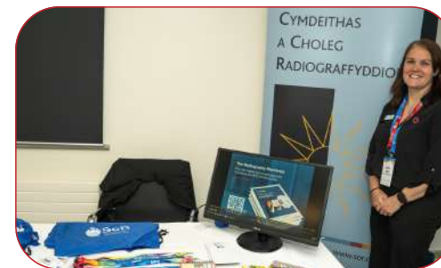
SOCIETY OF RADIOGRAPHERS