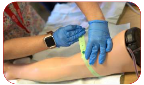
CANNULATION COURSE - SEPTEMBER 2024