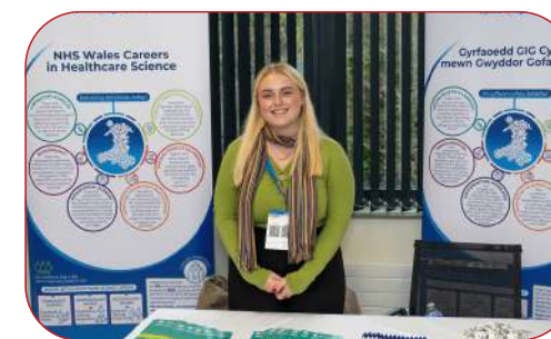
HEALTHCARE SCIENCE CYMRU