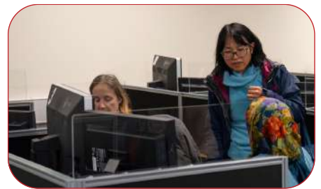
ONCOLOGY STUDY DAY - DECEMBER 2024