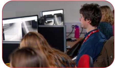
EMERGENCY MEDICINE COURSE - FEBRUARY, APRIL, AUGUST AND DECEMBER 2024