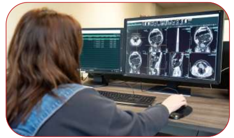
CT COLONOSCOPY COURSE - OCTOBER 2024