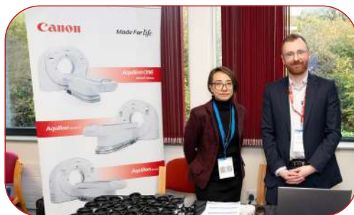
CANON MEDICAL LIMITED